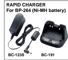
RAPID CHARGER For BP-264 (Ni-MH battery)