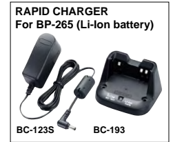
RAPID CHARGER For BP-265 (Li-Ion battery)