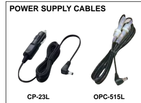
POWER SUPPLY CABLES