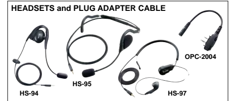
HEADSETS and PLUG ADAPTER CABLE