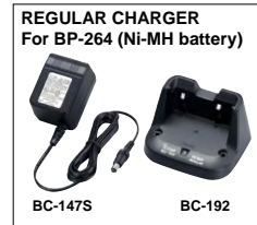
REGULAR CHARGER For BP-264 (Ni-MH battery)

*Tx: Rx: standby = 5:5:90. Power save function ON.